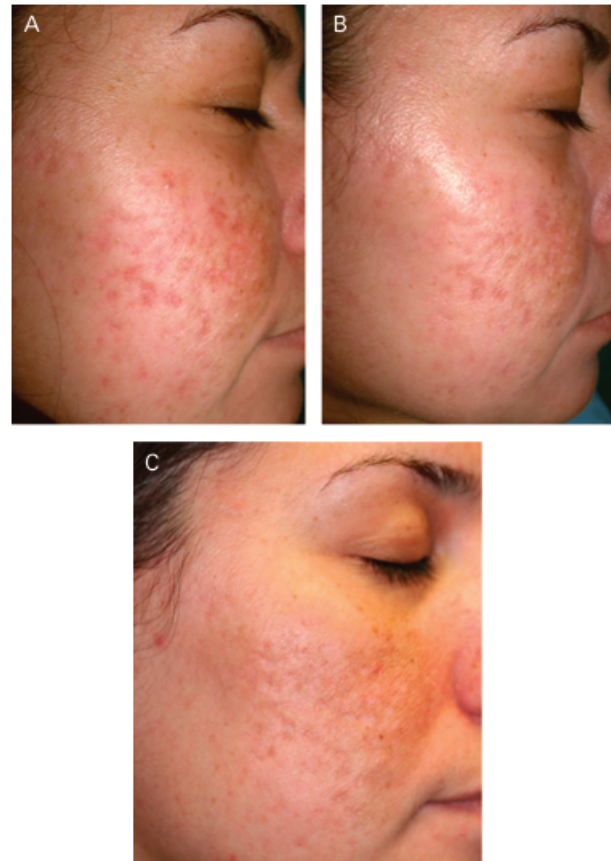
Figure 2. (A) Right cheek before Fraxel laser treatment. (B) One month after a single Fraxel laser treatment (6 mJ, 2,000 MTZs/cm 2 ). Note the marked reduction in the postinflammatory erythema compared to baseline (A). (C) Right cheek after six Fraxel treatments demonstrating marked improvement in acne scarring from baseline.

Photographic documentation and clinical improvement scores were determined preprocedure and at 2 weeks after the Fraxel treatment. Follow-up results after a single treatment revealed a marked clinical improvement in the degree of postinflammatory erythema based on independent physician clinical assessments using a quartile grading scale